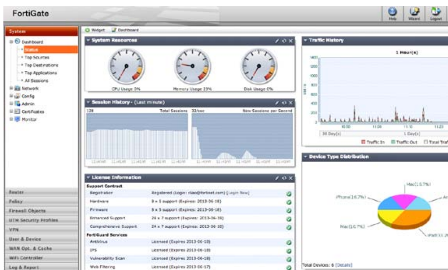
FortiOS Dashboard — Single Pane of Glass Management

Fortinet FortiGuard Subscription Services provide automated, real-time, up-to-date protection against the latest security threats. Our threat research labs are located worldwide, providing 24x7 updates when you most need it.