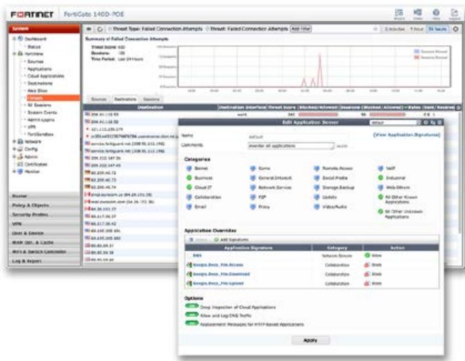
FortiOS Management UI — FortiView and Application Control Panel