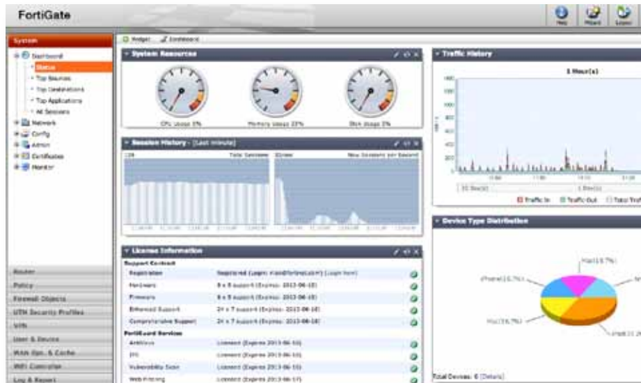
FortiOS Dashboard — Single Pane of Glass Management

Fortinet FortiGuard Subscription Services provide automated, real-time, up-to-date protection against the latest security threats. Our threat research labs are located worldwide, providing 24x7 updates when you most need it.