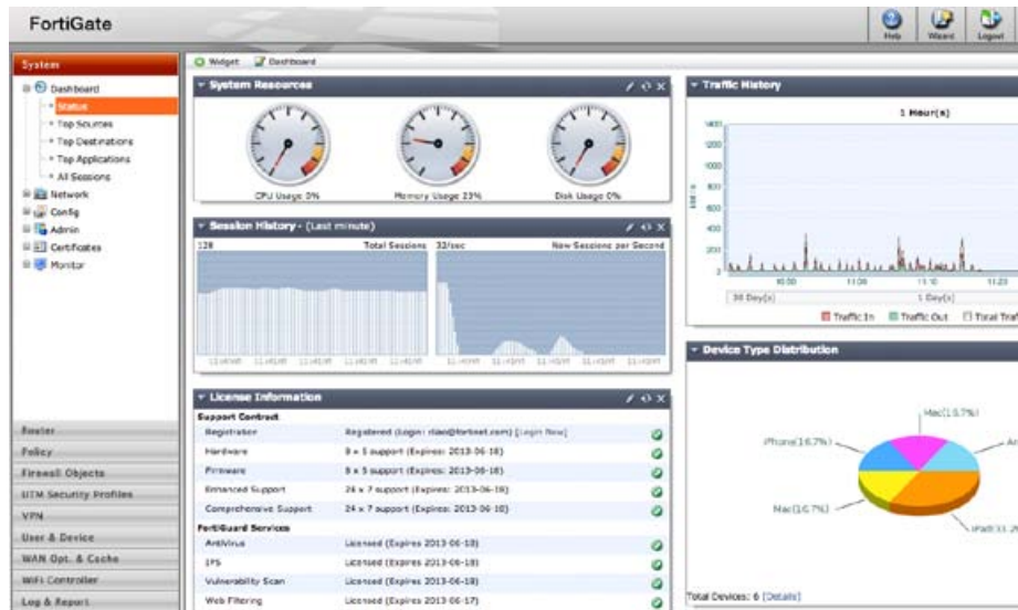
FortiOS Dashboard — Single Pane of Glass Management

Fortinet FortiGuard Subscription Services provide automated, real-time, up-to-date protection against the latest security threats. Our threat research labs are located worldwide, providing 24x7 updates when you most need it.