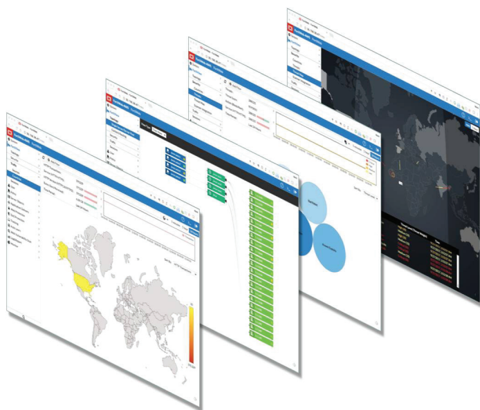
FortiView for FortiWeb

FortiWeb includes a suite of graphical analysis tools called FortiView. Similar to other Fortinet products such as FortiGate, FortiWeb gives administrators the ability to visualize and drill-down into key elements of FortiWeb such as server/IP configurations, attack and traffic logs, attack maps, and user activity. FortiView for FortiWeb lets administrators quickly identify suspicious activity in real time and address critical use cases such as origin of threats, common violations, and client/device risks.