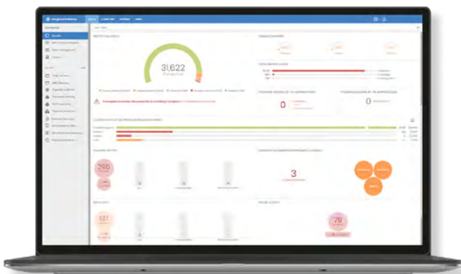
Figure 1: Main Panda Adaptive Defense Dashboard.